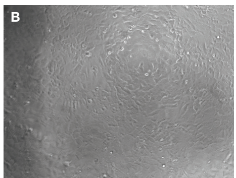
Figure 1. Post-transfection analysis of cells. (A) Fluorescence and (B) bright-field images demonstrating 75–85% transfection efficiency.